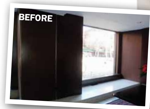
A REBIRTH IN QUEENS: Renovation at the Bel-Air.