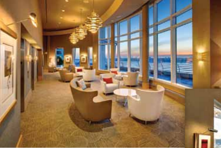
A "REFRESH" WAS NEEDED: Trump Place redesign.